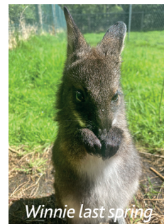
Winnie last spring

Last spring Winnie was still in the pouch when her mum was killed on the road. Keeper Carly came to the rescue and used her animal