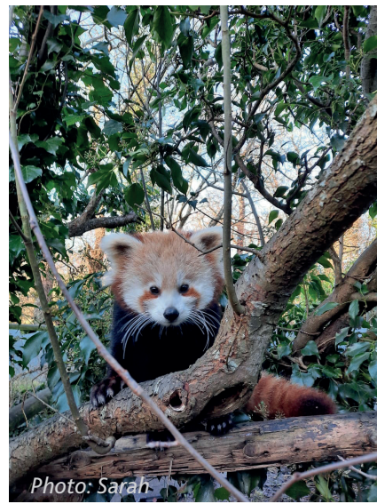
Aria - Kush's daughter