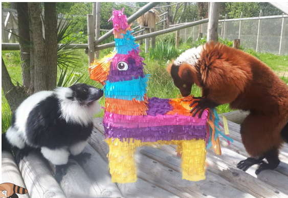
Pinata puzzle for the ruffed lemurs